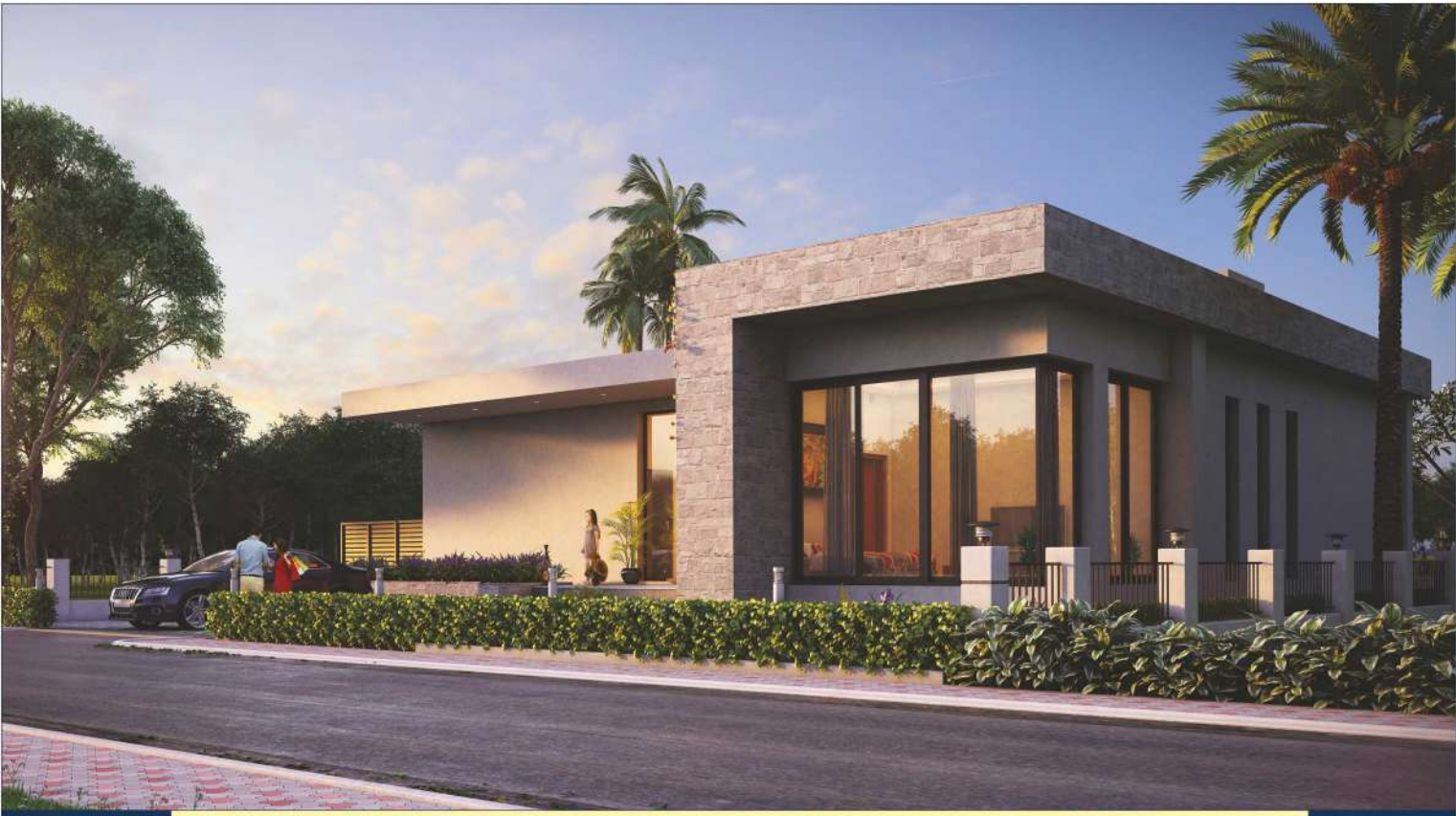
Villa Type B - 1760 sq ft Living & Dining Room + Family Room + 2 Bedrooms + 2 Toilets + Servant Room with Toilet + Store