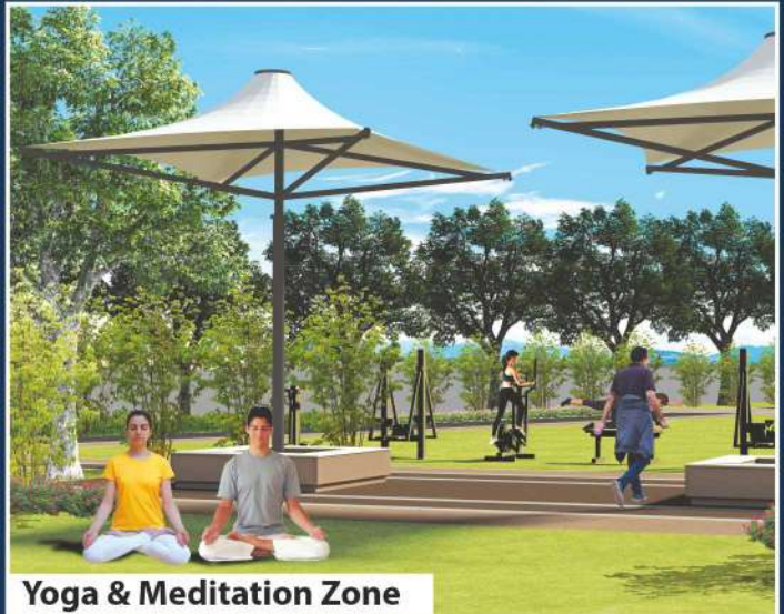
Yoga & Meditation Zone