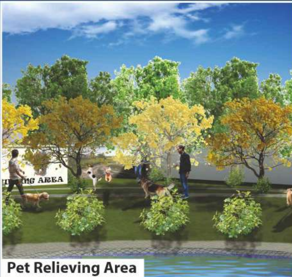
Pet Relieving Area