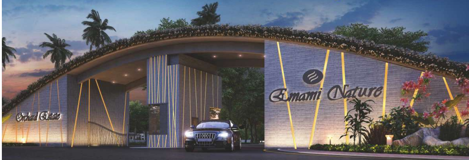
Actual Entry Gate

Emami Nature , the nature centric project is developed by Emami Realty Ltd. , the real estate arm of Emami Ltd. with a Goodwill of more than four Decades. Emami Limited is one of the leading and fastest growing personal and healthcare businesses in India, with an enviable portfolio of household brand names such as Boro Plus, Navratna, Fair and Handsome, Zandu Balm, Mentho Plus Balm, Fast Relief and Kesh King. Emami Realty Ltd. has a pan India presence with over 3.6 crore Sq. Ft development at different stages of planning, construction and delivery across West Bengal, Uttar Pradesh, Tamil Nadu, Andhra Pradesh, Orissa, Maharashtra and Sri Lanka. These projects are being executed under various Special purpose Vehicles (SPVs) and joint ventures (JVs). The Group has the distinction of delivering some of the landmark projects including South City project (commercial cum residential), Urbana (residential) & Orbit Heights (residential) in Kolkata.